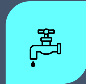
Drinking Water Quality