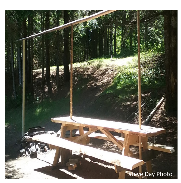
New Table with Tarp Poles at Umsaskis Lake