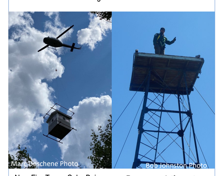
New Fire Tower Cabs Being Placed at Round Pond