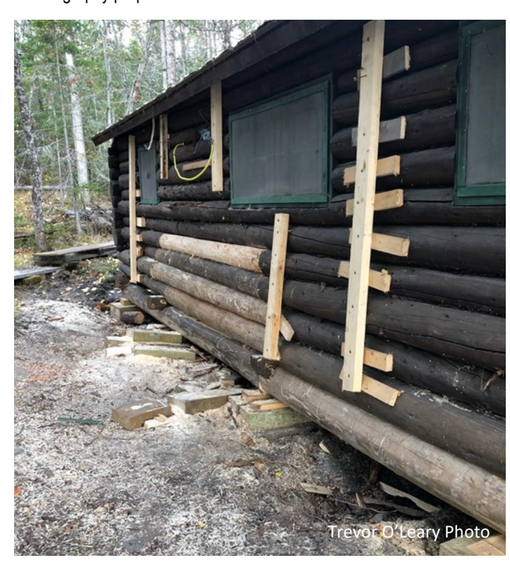
Camp Pleasant Repair