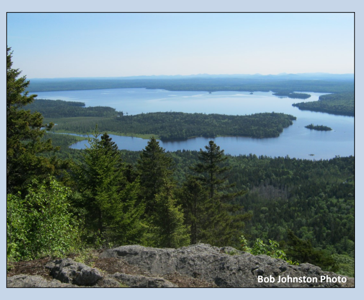
View from Allagash Mountain