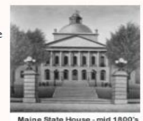
Maine State House - mid 1800's

The Office of Program Evaluation and Government Accountability (OPEGA) exists to support the Legislature in monitoring and improving the performance of State government by conducting independent, objective reviews of State programs and activities with a focus on effectiveness, efficiency and economical use of resources. Within this context, OPEGA also evaluates compliance with laws, regulations, policies and procedures.